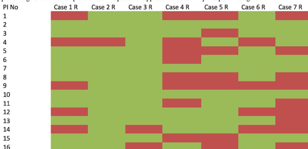
Figure 3. Heatmap showing randomization preferences if a posterior approach is used. PI: principal investigator.