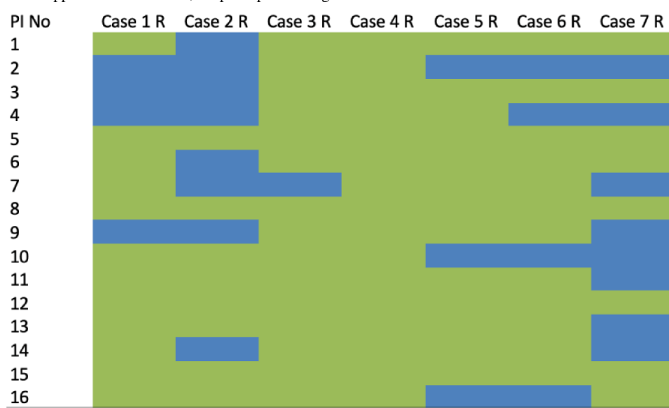
Figure 1. Heatmap showing investigator replies in relation to the chosen surgical approach from the case vignettes. Green represents posterior approach and blue represents anterior approach. No: number; PI: principal investigator.

A total of 16 (53%) of the 30 PIs completed the survey. Most respondents were trained as neurosurgeons (12/16, 75%) and