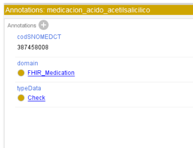
Figure 1. Systematized Nomenclature of Medicine Clinical Terms (SNOMED CT) and Health Level 7 Fast Healthcare Interoperability Resources (HL7 FHIR) mappings.

The establishment of the relationships between the clinical concepts and the premises to design the mini-rules was carried out through a propositional logic system (true or false, less than or greater than, etc). For the super-rules' design (Figure 2), the logical relationships between the different clinical concepts and premises (and/or) was also established.