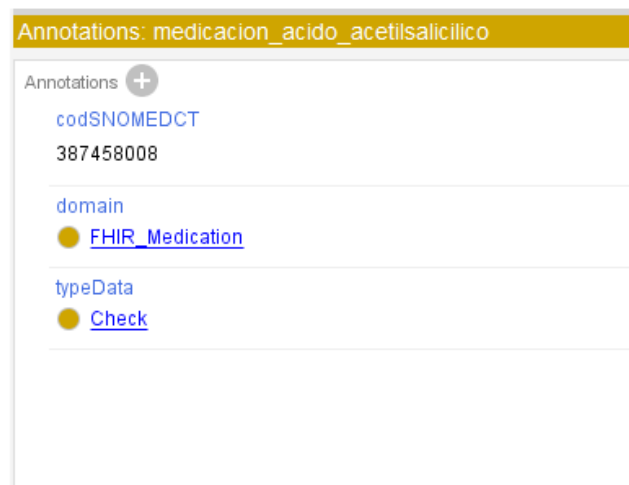
Figure 1. Systematized Nomenclature of Medicine Clinical Terms (SNOMED CT) and Health Level 7 Fast Healthcare Interoperability Resources (HL7 FHIR) mappings.

The establishment of the relationships between the clinical concepts and the premises to design the mini-rules was carried out through a propositional logic system (true or false, less than or greater than, etc). For the super-rules' design (Figure 2), the logical relationships between the different clinical concepts and premises (and/or) was also established.