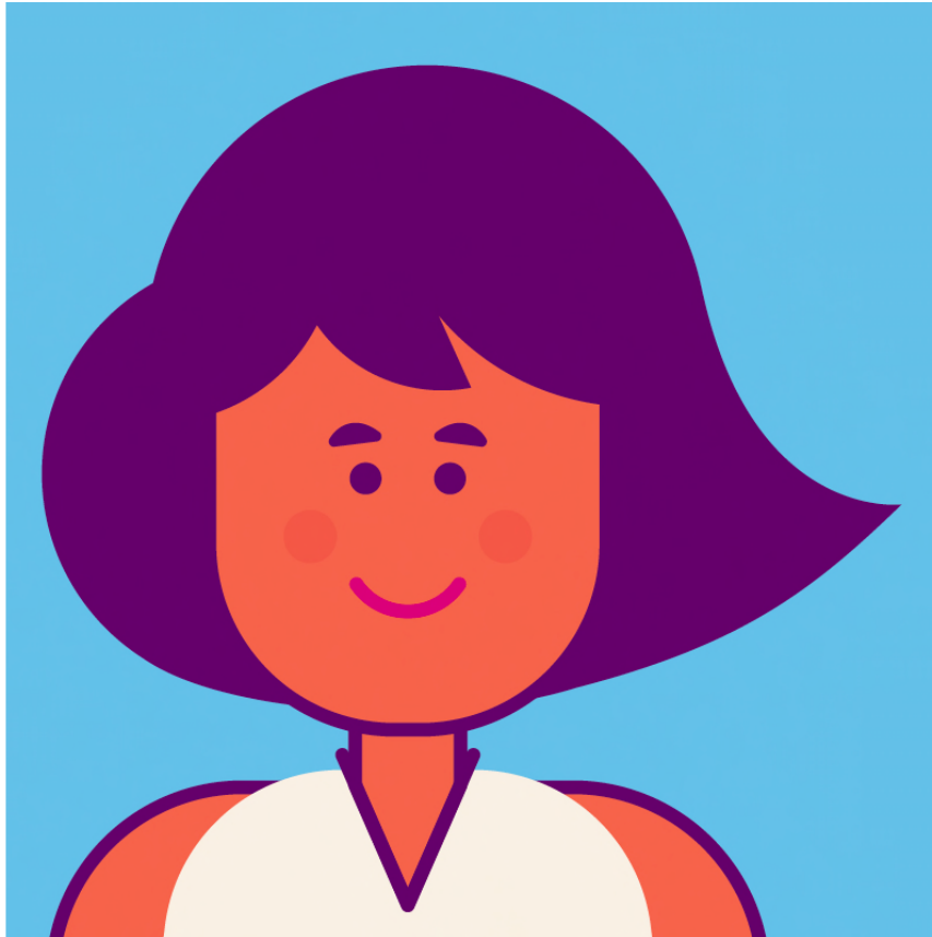
Figure 1. The chatbot avatar Viki.

The chatbot is built on ruby and javascript, and was created by the team at TNH Health. The checkup assessment is rule-based, with the next steps determined by user responses. As part of the design process, decision trees were defined, and all possible user journeys were mapped and analyzed. Decision trees enabled the chatbot to provide the right responses and information based on the user's inputs (ie, to customize the conversation). For example, if the user responds that they want to know more about depression, the chatbot delivers further information about the topic. If the user prefers to continue without knowing more about the topic, the chatbot takes them to the next topic. Building a decision tree creation tool with all of the necessary settings for interactions and data organization allowed the chatbot to be updated in an agile way without needing a new system release, which was deemed to be crucial to the development.