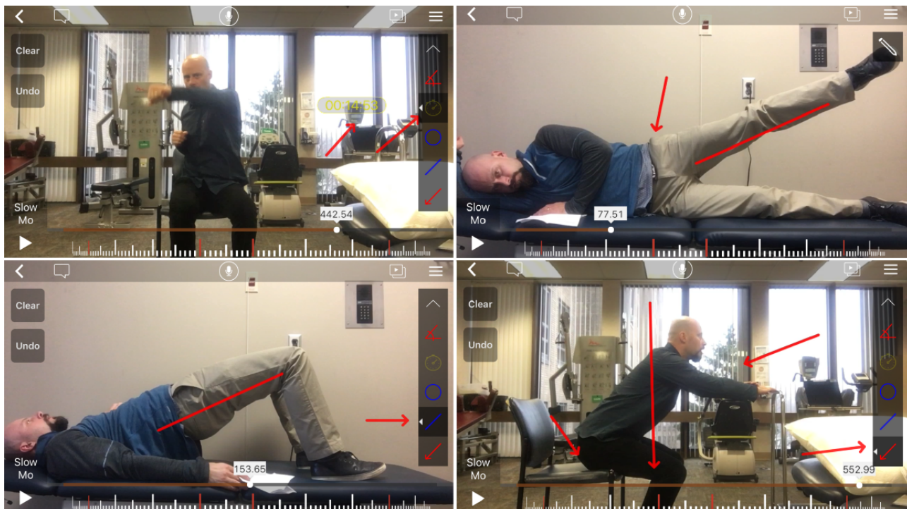
Figure 1. Examples of Hudl app video captures of the telehealth physical therapist's home exercise program. The telehealth physical therapist used the tools displayed on the right-hand side of the screen (arrows, plumb line, chronometer, etc) to highlight the parts that participants needed to pay attention to.

At 8 and 24 weeks, participants completed a questionnaire anonymously on the web (17/45, 38%) or in paper format (28/45, 62%) if they had trouble completing the web-based survey. The survey asked the participants to quantify their average HEP adherence per week; overall PT satisfaction; and, for the experimental group, satisfaction with the app and telehealth use. Scoring for questions ranged from 1 (very dissatisfied or difficult) to 7 (very satisfied or easy). Overall PT satisfaction encompassed both the Hudl app with telehealth platform use and care or feedback from the telehealth physical therapist and treating PT service for the experimental group and HEP on paper and the treating PT service for the control group.