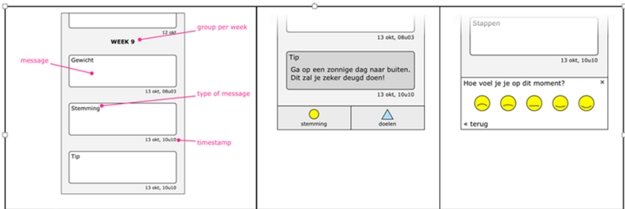
Figure 3. Wireframes of the INTER-ACT app: stream of messages (left), coaching message (center), and manual input of mood (right).

The first prototype of the app was tested for functionality and feasibility by two pregnant women and a multidisciplinary team involving a professor of gynecology, a professor of midwifery, a biostatistician, a psychologist, two lifestyle coaches, and a group of app developers. They provided feedback regarding the design from medical, wellbeing, and technical perspectives. An iterative process of adaptation led to the development of the INTER-ACT app, which is being used in an ongoing RCT.