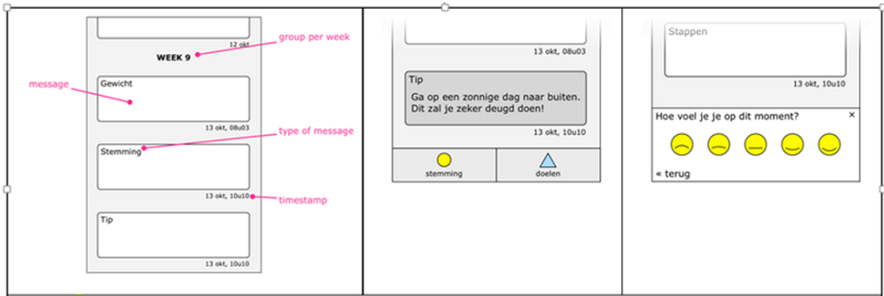
Figure 3. Wireframes of the INTER-ACT app: stream of messages (left), coaching message (center), and manual input of mood (right).

The first prototype of the app was tested for functionality and feasibility by two pregnant women and a multidisciplinary team involving a professor of gynecology, a professor of midwifery, a biostatistician, a psychologist, two lifestyle coaches, and a group of app developers. They provided feedback regarding the design from medical, wellbeing, and technical perspectives. An iterative process of adaptation led to the development of the INTER-ACT app, which is being used in an ongoing RCT.